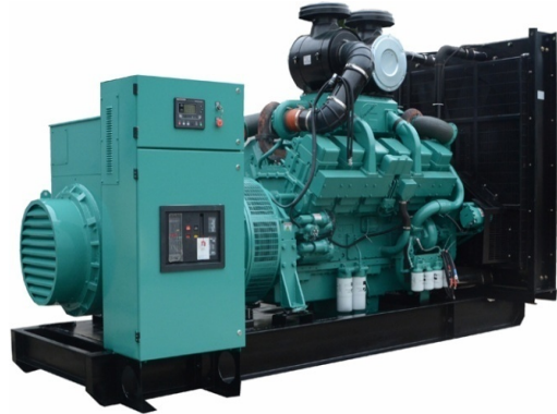
Genset Image for illustration purposes only