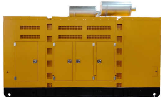
Genset Image for illustration purposes only