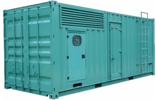
Genset Image for illustration purposes only