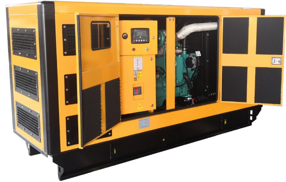
Genset Image for illustration purposes only