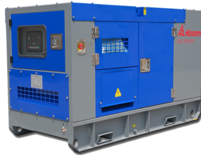
Genset Image for illustration purposes only