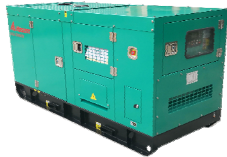
Genset Image for illustration purposes only