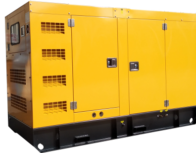
Genset Image for illustration purposes only