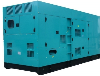
Genset Image for illustration purposes only