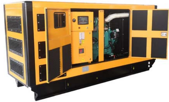
Genset Image for illustration purposes only