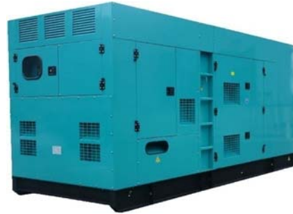
Genset Image for illustration purposes only