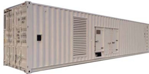
Genset Image for illustration purposes only